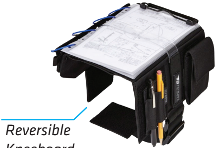
Reversible Kneeboard with Clipboard